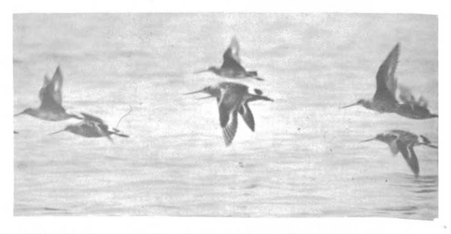
Hudsonian Godwits in flight, on Monomoy, August 1977.