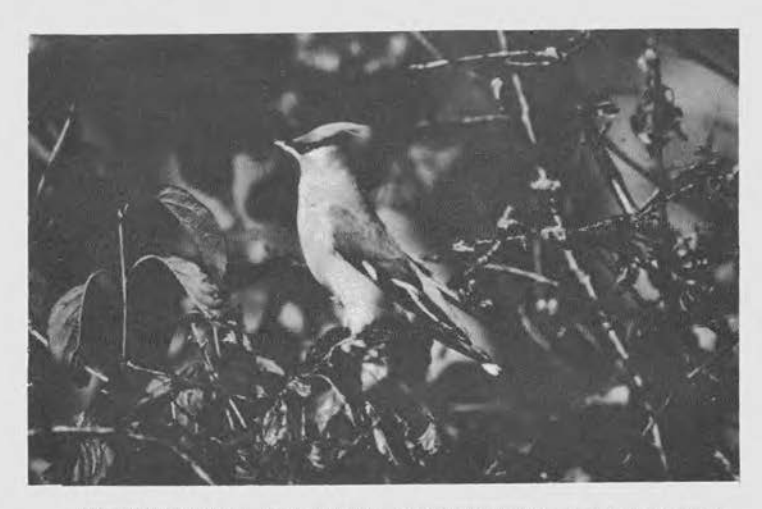
BOHEMIAN WAXWING, THE GLADES, NORTH SCITUATE, 2 NOVEMBER 1975